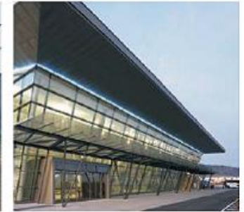
Getxo Cruise Terminal Getxo-Bizkaia (Spain) Architect: Ajuriaguerra Tres