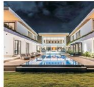
Yarari Royale Punta Cana (Dominican Republic) Architect: Estudio ST3 (Guzman Solana)