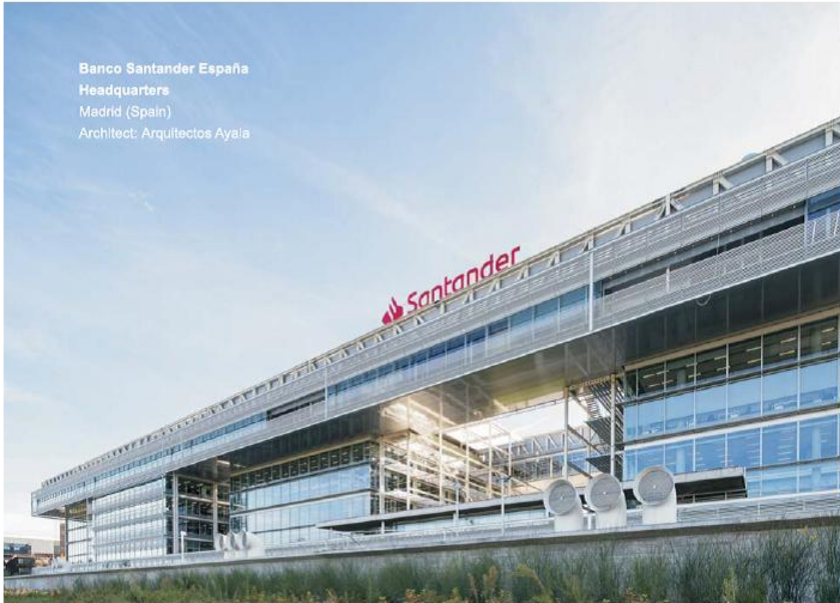
Banco Santander España Headquarters Madrid (Spain) Architect: Arquitectos Ayaia