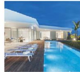
Abama 3B1 House Guía de Isora-Canary Islands (Spain) Architect: Leonardo Omar Arquitectos