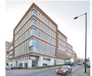
Graduate School (Sheffield University) Sheffield (United Kingdom) Architects: Brond Bryan Architects