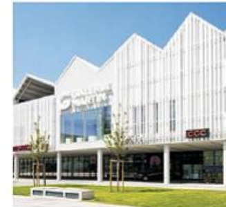
OC Galéria Martin Martin (Slovakia) Architect: A 800