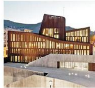
Ortuella Community Centre Ortuella - Bizkaia (Spain) Architect: aq4 Arquitectura