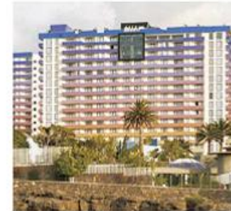
Hard Rock Hotel Tenerife Santa Cruz de Tenerife (Spain) Architect: Estudio Vila 13