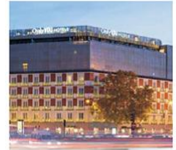
Only You Hotel Madrid (Spain) Architect: Lugar Arquitectos