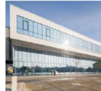
MoJ Aréna Dunajská Streda (Slovakia) Architect: AD|F