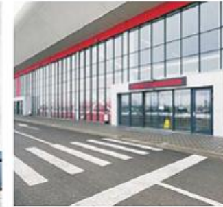
George Enescu International Airport Bacau (Romania) Architect: Geo Arc