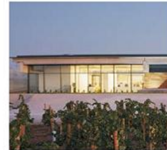
Beronia Rueda Winery Rueda - Valladolid (Spain)