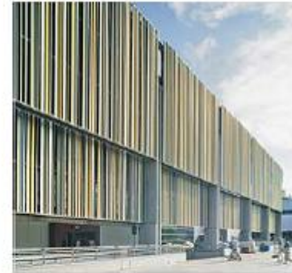
Gran Canaria Airport Gran Canaria - Las Palmas (Spain) Architect: Lamela + Richard Rogers Partnership