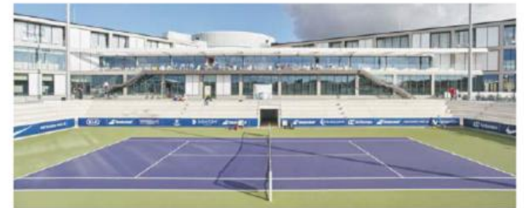
Sports Centre Rafa Nadal Manacor - Illes Balears (Spain) Architects: Bimbe / Talat (Engineering & Project Management)