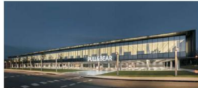
Pull & Bear Headquarters Narón - A Coruña (Spain) Architect: Balle I Roig