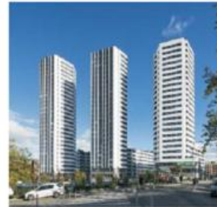
Garellano Towers Bilbao - Bizkaia (Spain) Architect: Fiark / IA+B Architecture