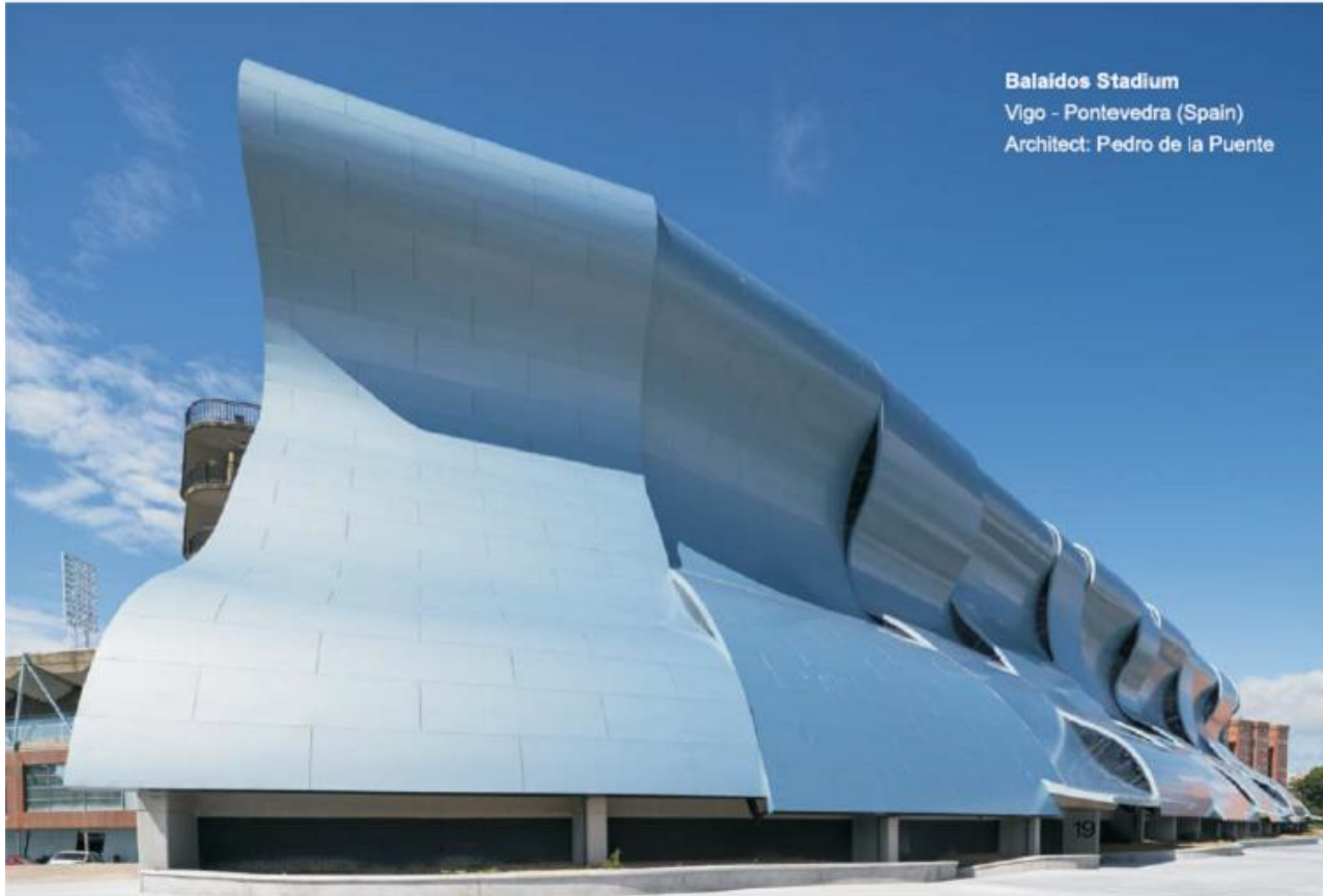
Balaidos Stadium Vigo - Pontevedra (Spain) Architect: Pedro de la Puente