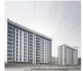
Transparent Residence 3 Bucarest (Romania) Architect: Memento Architecture