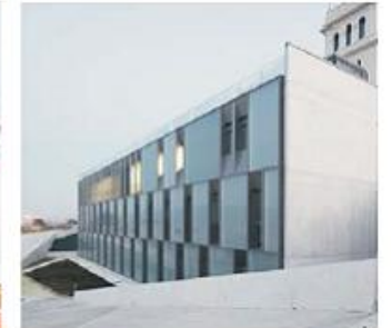
Higher School Jaizkibel San Sebastian, Donostia Gipuzkoa (Spain) Architect: Oxotorena Arquitectos