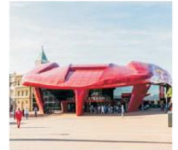
Ferrari Land Portaventura Salou - Tarragona (Spain) Architect: Idom