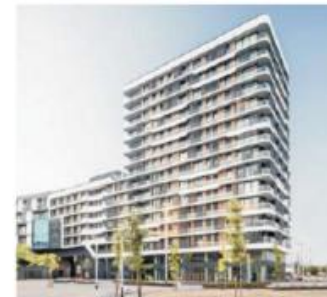
El Rengle Tower Mataró - Barcelona (Spain) Architect: ON-A Architecture