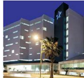
Playa de Palma Iberostar Hotel Palma de Mallorca - Illes Balears (Spain) Architect: Studi Oliver Arquitectura