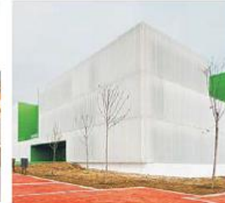
Social Services Centre Móstoles - Madrid (Spain) Architect: Dosmasuno Arquitectos