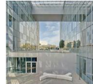
Facultad de las Ciencias de la Salud Universidad Jaime I Castellón (Spain) Architect: GAD Arquitectura