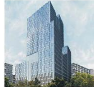
BBVA Bancomer Corporate Headquarters Mexico City (Mexico) Architect: SOM